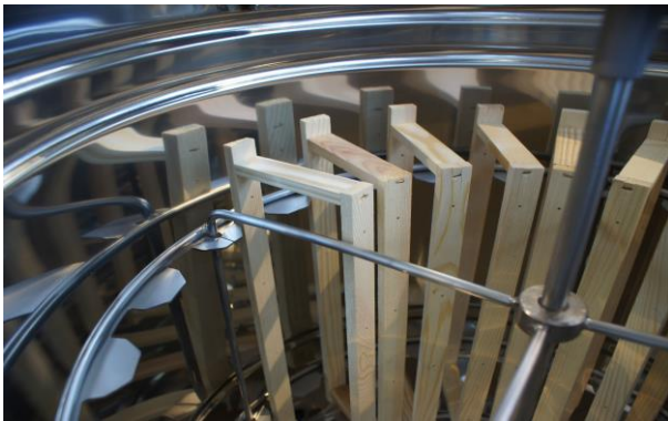
Fig. 7 The correct arrangement of frames in the Radial basket