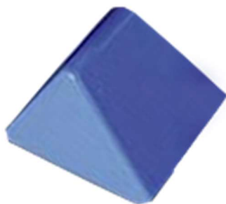
Fig.1. The method of placing hard-consistency cappers