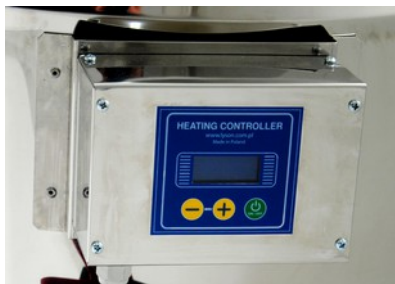
pic.1 temperature controller